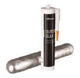
OUTSIDE GLUE page 154