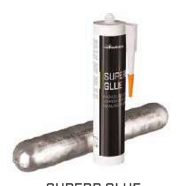
SUPERB GLUE page 150